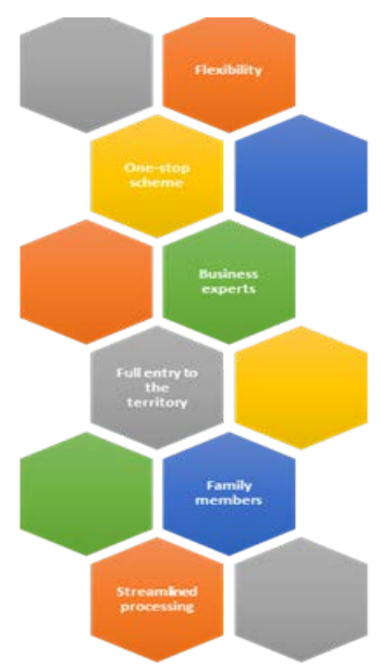
Figure 1. Key considerations of the Spanish startup scheme