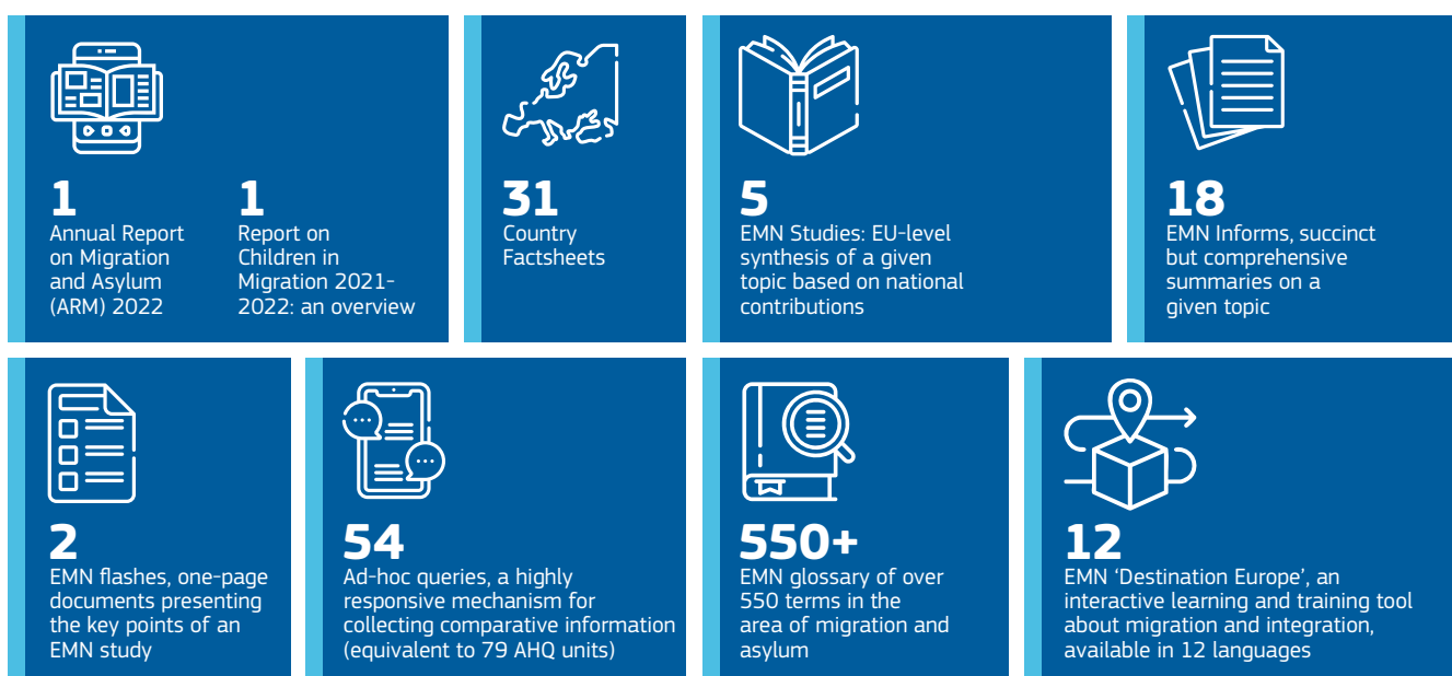
Figure 1: Overview of EMN outputs developed during 2023

and analysis of information and statistics to meet these needs, in various formats (see below).